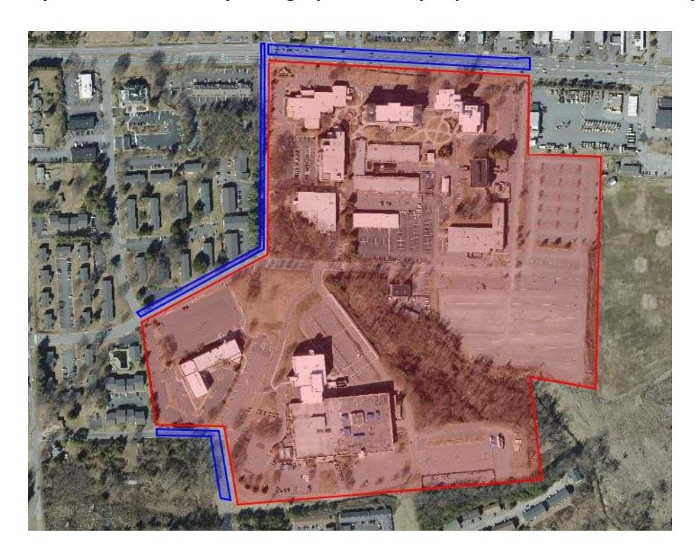
Forsyth Tech Community College | West Campus | 1300 Bolton Street

Forsyth Tech Community College | Main Campus | 2100 Silas Creek Parkway